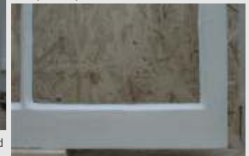
After our work this window will now last for many more years