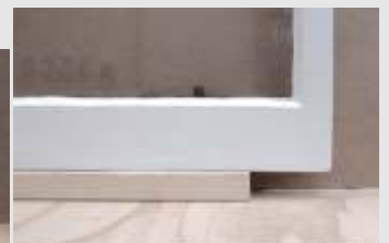
After our work this window is fully protected and last for many more years

Replacing sash windows can be very expensive and cost 3-4 times more than restoring them. Restored professionally sash windows will last for many more years. We can restore sash and case windows back to their original working condition, even windows that appear to be beyond repair. Our work is fully guaranteed