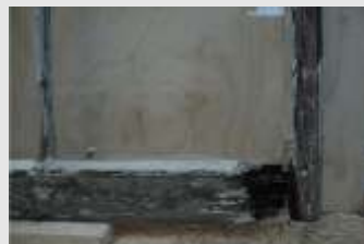
Before our work this window appears beyond repair

Replacing sash windows can be very expensive and cost 3-4 times more than restoring them. Restored professionally sash windows will last for many more years. We can restore sash and case windows back to their original working condition, even windows that appear to be beyond repair. Our work is fully guaranteed