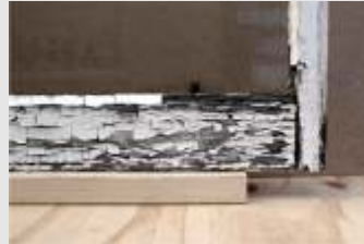
Before our work this window was in early rot stage

We will carry out a full and professional assessment of your windows. Comprehensive check for rotted wood on your windows. No unseen extra charges for unseen rot wood. Estimates within 48 hours or next working day if required